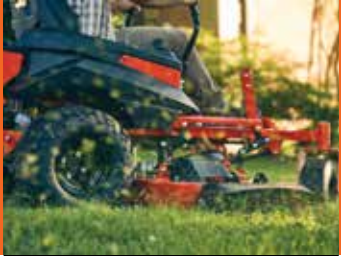
NEVER CUTTING CORNERS OF QUALITY

The ZT Avenger offers great value for homeowners, featuring the same build quality, durability, power, and performance as all Bad Boy Mowers, at an unexpected price.