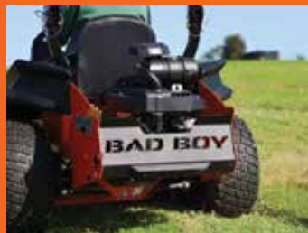
MOW LIKE A PRO

Our patented EZ-Ride 3-link trailing suspension is the first and only of its kind to provide a smoother ride, improve tyre contact consistency and increase traction for a legendary mowing experience.