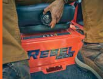
PERFORMANCE THAT ADJUSTS TO YOU

The Rebel comes loaded with premium features for a better mowing experience. You'll get our adjustable suspension seat, run-flat tyres, speed tracking, and adjustable handles at no additional cost.