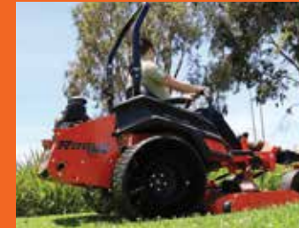
PATENTED 3-LINK TRAILING ARM SUSPENSION SYSTEM

Rear discharge zero-turn mowers offer precise, controlled mowing - perfect for landscaped or tight spaces. They deliver clean clipping flow, keeping debris off sidewalks, flower beds, and surrounding areas.