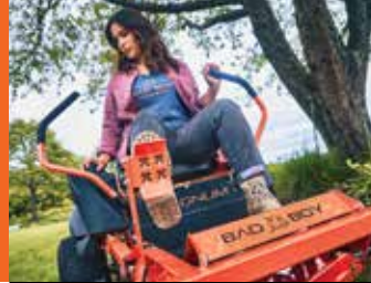
GET DIALED IN

Most mowers in this price range use flimsy, bolted steel. The MZ Magnum, however, is built with the same professional quality as our commercial mowers.