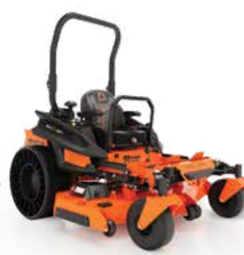
ROGUE REAR DISCHARGE