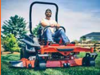
BRING COMMERCIAL GRADE POWER HOME

Featuring Bad Boy's signature power at a price designed for homeowners. Choose between two powerful engines and two heavy duty deck sizes to give your yard a professional quality cut every time.