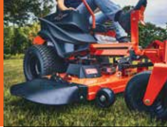
LEGENDARY ALL-STEEL, ALL-WELDED DECK

The ZT Avenger offers great value for homeowners, featuring the same build quality, durability, power, and performance as all Bad Boy Mowers, at an unexpected price.