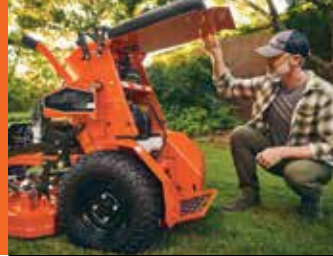
COMFORT YOU CAN STAND BEHIND

The Revolt SD is available in 34" and 42" deck sizes that fit through a gate with no problems. It's perfect for tight fits and a cleaner cut, and the smaller sizes make it even easier to store at your home.