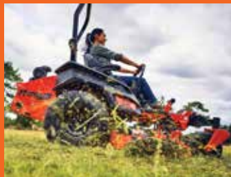
TOUGHEST DECK IN ITS CLASS

Every Rogue comes fully equipped with our adjustable suspension seat, built-in striping kit, run-flat tyres, speed tracking, and adjustable handles, for commercial and residential mowers alike.