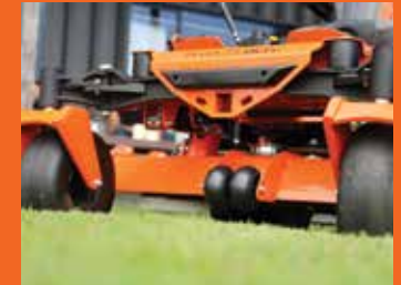
NO-FLAT FRONT TYRES

The EZ-Ride® GEN 2 Suspension delivers a smoother ride, better traction, and improved hillside stability - now paired with our patented independent front suspension for the smoothest ride yet.