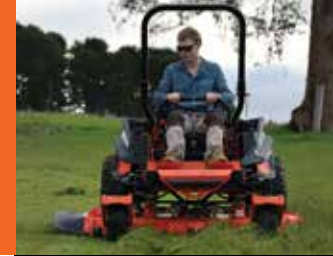
A HEAVY DUTY DECK FEATURES

The Renegade Diesel, powered by 1100cc of diesel torque, provides robust, long-lasting performance, making it the perfect choice for lawn care professionals and large-acre homeowners who require reliable strength for demanding tasks.