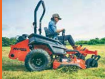
SETTING THE STANDARD FOR FEATURES

Featuring Bad Boy's signature power at a price designed for homeowners. Choose between two powerful engines and two heavy duty deck sizes to give your yard a professional quality cut every time.