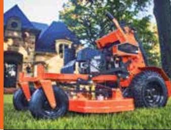
JUST THE RIGHT SIZE

The Revolt SD is built for comfort, control, and a smooth ride. Its patented full-suspension operator platform reduces fatigue, while the inset I-Beam front rail, 9.5mm steel forks, and 82.55mm trail deliver smooth, easy handling.