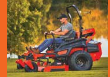
PATENTED 3-LINK SUSPENSION

The Renegade features a sloped nose 3-gauge, 6mm fabricated deck with 13mm leading edge and 9.5mm side reinforcements, making it the heaviest-built deck of any commercial mower.