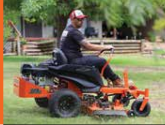
TAKE A SEAT